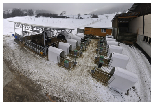
Fig. 1. Overview of an 'outdoor veal calf' facility: 12 individual hutches with outdoor pens and two group hutches with sheltered and straw-bedded outdoor pens were used in each of the 19 intervention farms. After birth or arrival after purchase, the calves completed a three-week quarantine period in individual hutches and were subsequently fattened in groups not exceeding ten calves.