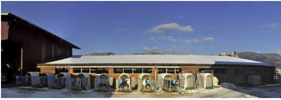
Fig. 2. Detailed view of individual hutch pens: Calves are quarantined in individual hutch pens with a minimal distance of 1 m between pens to allow for visual contact among calves but prevent potential exchange of pathogens.