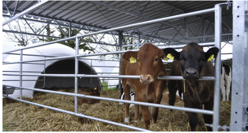
Fig. 3. Detailed view of a group pen: Both the ground of the hutch and the outside pen are straw-bedded (minimal depth of the straw bed: 30 cm). The roof prevents soaking of the bedding due to rainfall and provides shade. Thus, calves can stay in the sheltered outside pen by any weather condition and have constant access to outdoor air quality.

hutches using a disinfectant containing chlorocresol (Neopredisan 135-1, Vital AG, Oberentfelden, Switzerland) after each use. A mobile heated milk tank ('Milk Taxi', Holm&Laue, Westerröndfeld, Germany) with a pump for efficient milk delivery to the calves was provided for each IF. The amount of fresh milk and supplements (milk replacer, vitamins and/or minerals) fed daily were determined by the farmers. The necessary equipment (hutches and 'Milk Taxi') was provided to the IF free of charge for the duration of the study. All components and procedures of the concept were approved by the competent authority (authorization number BE 71/16) and fully complied with the Swiss animal welfare legislation. The managers of CF did not alter their daily routine and their calves were fattened in accordance with the IP-SUISSE label requirements including constant access to a non-roofed outdoor pen. Correspondingly, no bedding was provided outdoors to avoid soaking of bedding material and no shelter from weather was available outdoors. In 15 of 19 CF, groups of calves were housed in barns where they shared the air space with other calf groups or cows. Calves purchased for fattening in CF were transported by livestock dealers where mixing of calves from different birth farms occurs (Schnyder et al., 2019b).